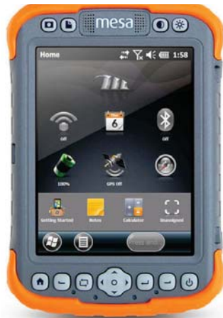
MESA ULTRA RUGGED PDA