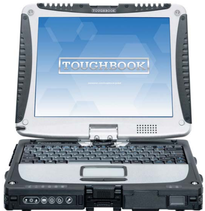
RUGGED CF-19 PC