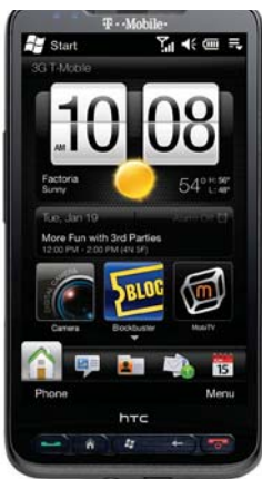
HTC MOBILE PDA